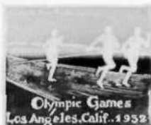
413 - 3/4 ACTUAL SIZE

This is the Olympic Games of Los Angeles, California the year of 1932.