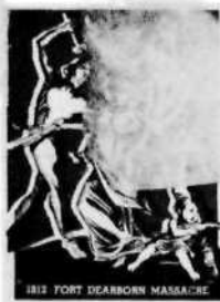
8425 - 3/4 ACTUAL SIZE

Here's a swell stamp for you history lovers. This stamp shows the Fort Dearborn Massacre which happened in 1812.