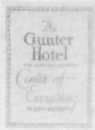
8504 - 1/2 ACTUAL SIZE