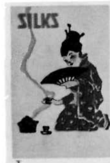
8501 - 3/4 ACTUAL SIZE

On this poster stamp silks represent the trade of the Japanese.