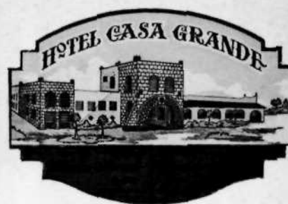
8507 - 1/2 ACTUAL SIZE