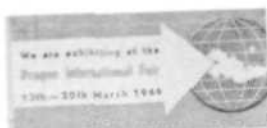
8424 - 1/2 ACTUAL SIZE

The above stamp represents an International fair given in Prague, on March 1949.