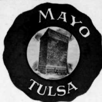
8506 - 1/2 ACTUAL SIZE