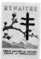
8427 - 3/4 ACTUAL SIZE

These French stamps show the fight for raising money for Tuberculosis and blind-ness.