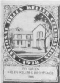
714 - 3/4 ACTUAL SIZE

Friends, here is a wonderful buy. For only 35¢ you may have the Helen Keller Series.