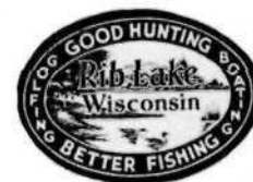
8503 - 1/2 ACTUAL SIZE

Do you like fishing and hunting? Well if you do, here's a nice stamp showing the better places for fishing.