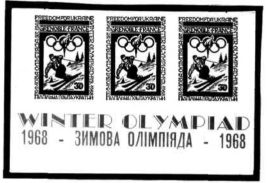
No.4 , Bottom of Imperf Sheet